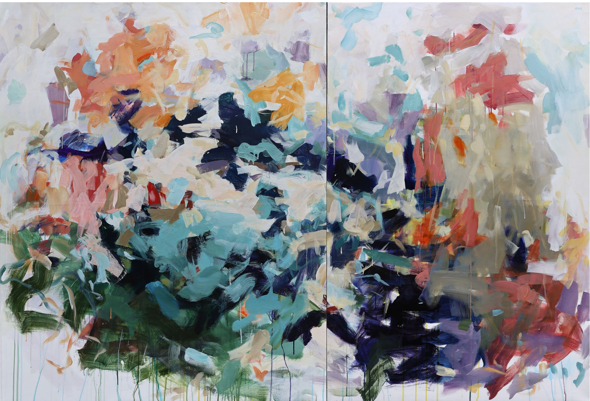
Counterpoints , 58" x 84", acrylic on linen