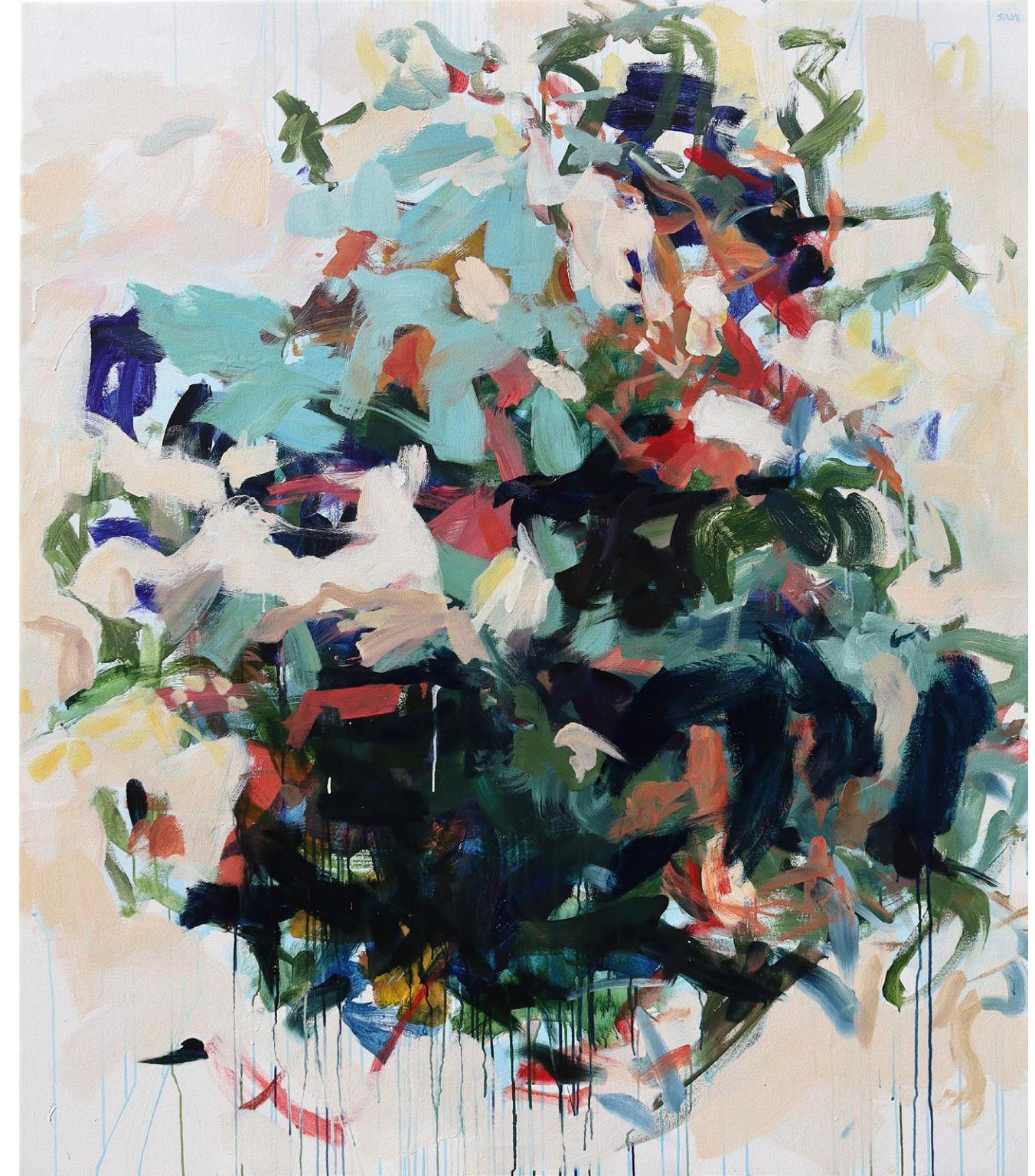
Afloat , 68" x 58", acrylic on canvas

In the painting " Afloat ", I decided to suspend colors floating in white space to express the sense of the movement when one is walking through the city.