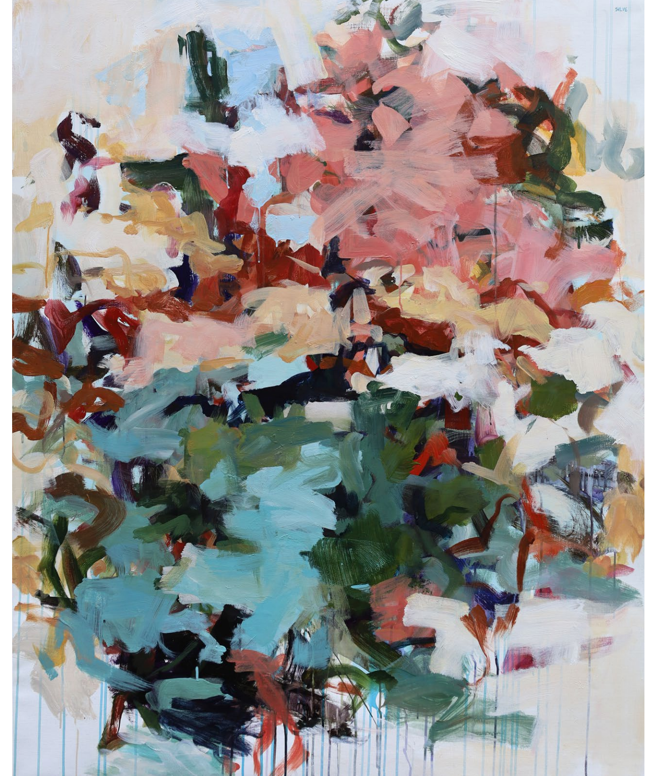
The Dance , 58" x 46", acrylic on linen

I loved taking the boats on the waterways. In fact, more than once I decided to pass my stop and take the boat as far as I could, then take another one back. The light was beautiful when the sun was setting. The orange and yellow buildings faded into the water.