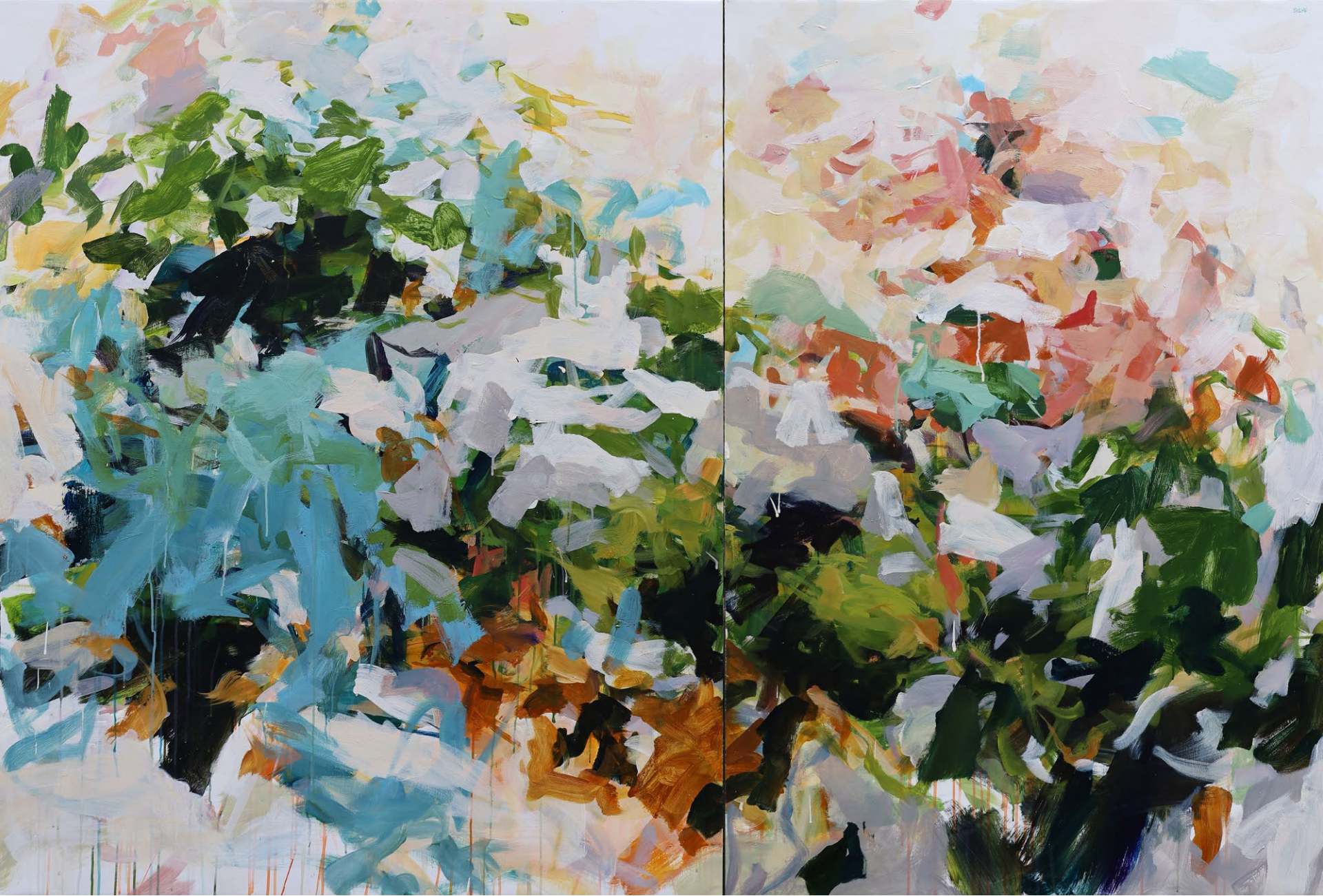
Karen Silve: The Sea & Shore